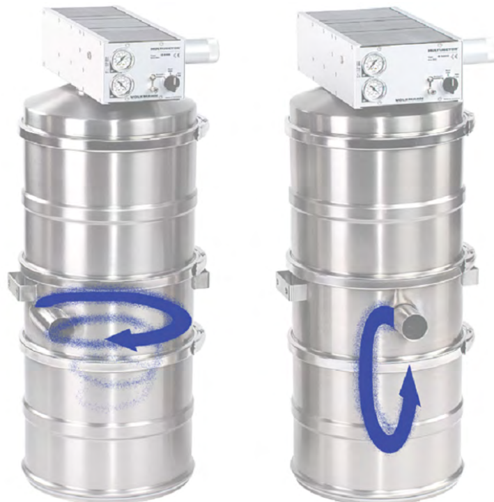
Figure 3 Radial or Tangential flow options in the Filter Receiver

Deciding on the correct conveying is not limited to the determination of the correct diameter of the conveying line and the suction port, but also the type of flow design in the separator container (Figure 3).