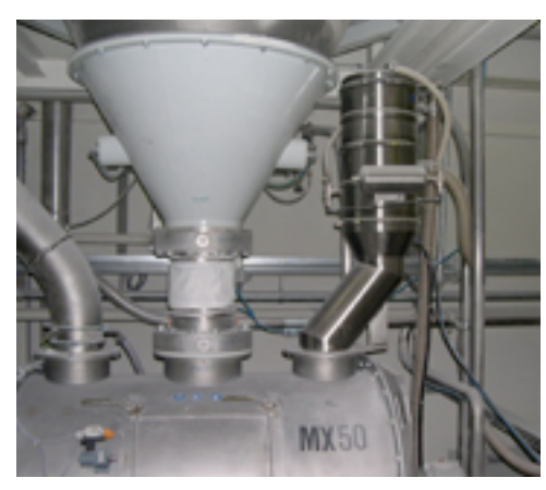
The majority of conveying tasks for pneumatic Volkmann vacuum conveyors are for capacities between 10 and 6000 kg/h ( Figure 4 ) whereas under extraordinary circumstances occasionally up to 16 t/h can be reached. Distances vary from just a few meters to up to 100 horizontal and up to 40 meters vertical.

Actual throughputs/capacities are strongly dependent upon the properties of the powders and bulk materials. Bulk density, adherent or bridging characteristics, particle size, surface shape, humidity and/or fat content, design of the pick-up point, feeding air supply and of course the total conveying distance, height and number of bends are crucial parameters of specific conveying tasks. With different products a variance in throughput rate up to 1000 kg/h, is common even with the same kind of conveyor.