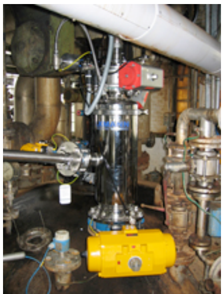
Figure 3: INEX Vacuum Conveyor for feeding bulk materials into a reactor

difficulties. These Volkmann vacuum conveying systems are the only ones fully ATEX certified for all relevant powder and gas EX zones. There is even an inerting system available (Figure 3).