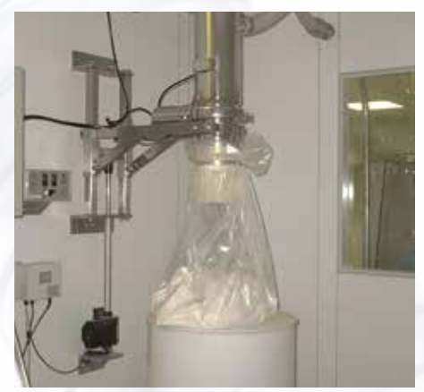
PPC 170 conveyor during testing in our test