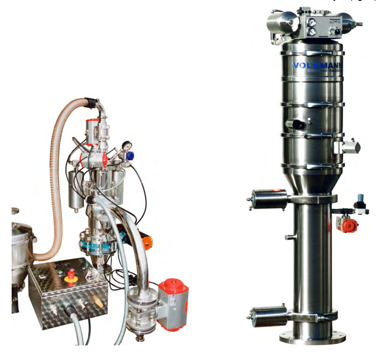
Fig 3 – Examples of an Inert Gas Based Conveyor (Left) and a Powder Lock System (Right)

This principle is expandable, so the Vacuum Conveyor can be designed to provide a positive pressure powder-lock if required. In this case, special pressure-resistant receiver vessels and valves are used to build the Vacuum Conveyor (fig. 3).