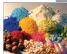
Conveying of dust, powder, pigments, flakes, granulated material, tablets, capsules, small parts, etc.