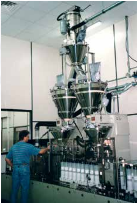
Carbon black toner transferred via a Volkmann conveyor to a bottle filling machine.

Carbon black, toner and pigment transfer, whether in powder or prill form, present a number of specific challenges during product transfer including environmental cleanliness and the avoidance of product segregation or degradation. These challenges are uniquely addressed by the Volkmann VS range of vacuum conveyors.