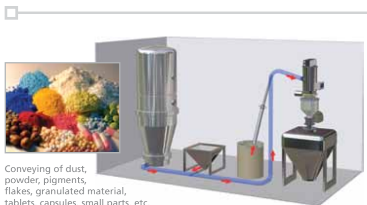
Conveying of dust, powder, pigments, flakes, granulated material, tablets, capsules, small parts, etc.

Special designs are available to fulfill the demands of the Chemical, Food, Pharmaceutical and Color/Lacquer Industries.