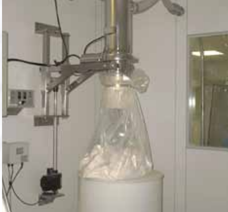
PPC 170 conveyor during testing in our test facility.