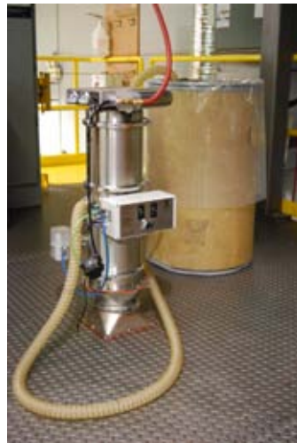
Left: VS200 is mounted on mezzanine above machine behind plastic sheeting. Right: Close up of VS200 in mezzanine mount.