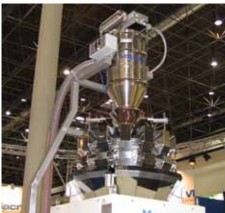
Loading of a multiple-bucket-weighing and dosing system.