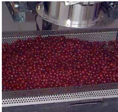
"Cherries in alcohol" transport; filled chocolate production.