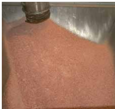
Granulated meat conveying in sausages-making process.