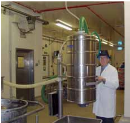
Flour transfer system in a bakery.