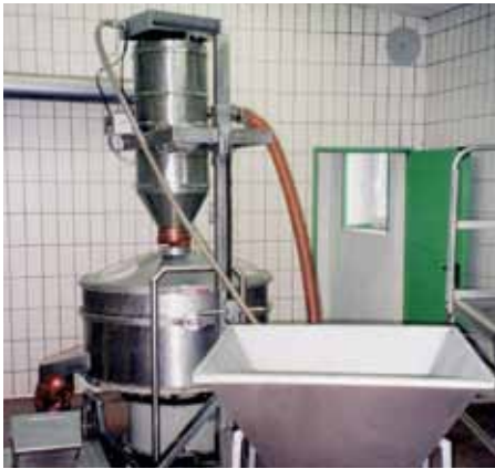
Conveying of spices from a hopper and loading of a sieve.