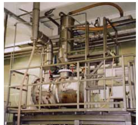
Vacuum Transport and loading of a mixer with powders for sauce-making.