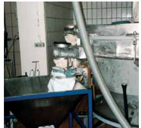
Feeding from a tumbling-sieve into a hopper for Vacuum Transfer.