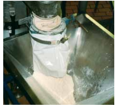
Loading of Cream-Fat powder (70 % fat) into a hopper and filling Big-Bags.