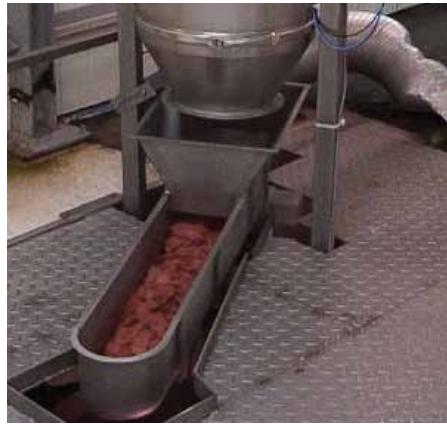
Transport of salami-slices for pizza-topping.