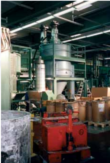
Carbon black toner transferred via a Volkmann conveyor to a bottle filling machine.

The need for a simple, safe, economic and CONTAINED system for powder transfer is paramount. In the transfer of filter aids, pigments, salts or corrosive chemicals, whether in powder or prill form. Volkmann's VS range of vacuum conveyors meets all of these parameters and does so with a design that can be adapted to almost any installation.