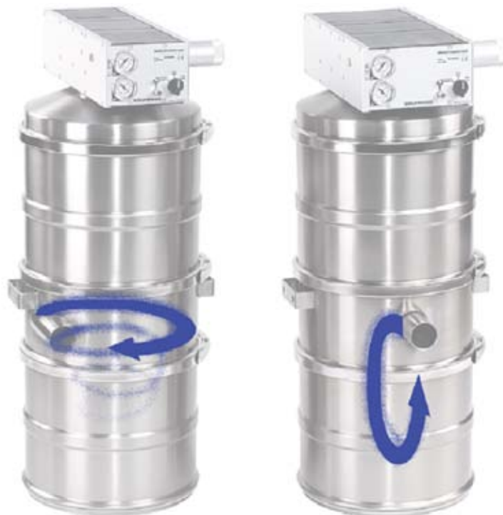
Figure 3 Radial or Tangential flow options in the Filter Receiver

Deciding on the correct conveying is not limited to the determination of the correct diameter of the conveying line and the suction port, but also the type of flow design in the separator container (Figure 3).