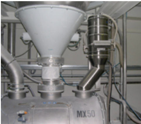
Figure 4: Volkmann vacuum conveyor (right) for feeding powder into a mixer

Actual throughputs/capacities are strongly dependent upon the properties of the powders and bulk materials. Bulk density, adherent or bridging characteristics, particle size, surface shape, humidity and/or fat content, design of the pick-up point, feeding air supply and of course the total conveying distance, height and number of bends are crucial parameters of specific conveying tasks. With different products a variance in throughput rate up to 1000 kg/h, is common even with the same kind of conveyor.