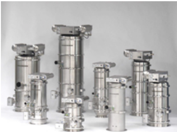
Figure 2: Overview of modular Vacuum Conveyors in different designs and sizes

be conveyed with the same equipment. Therefore it is desirable to have a simple construction, which allows for easy manual disassembly and cleaning avoiding cross contamination. For example, manufacturers of paints and coatings that use this technology are able to convey different colored dye powders (particle sizes 0.2 to 50 microns) or even toner, whereby major color changes from black to white are possible without difficulties.