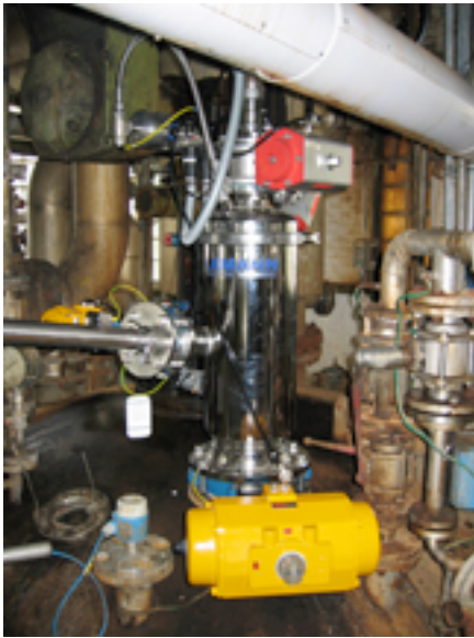
Figure 3: INEX Vacuum Conveyor for feeding bulk materials into a reactor

difficulties. These Volkmann vacuum conveying systems are the only ones fully ATEX certified for all relevant powder and gas EX zones. There is even an inerting system available (Figure 3) .