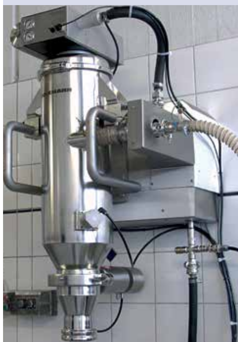
Wall Mounted Conweigh